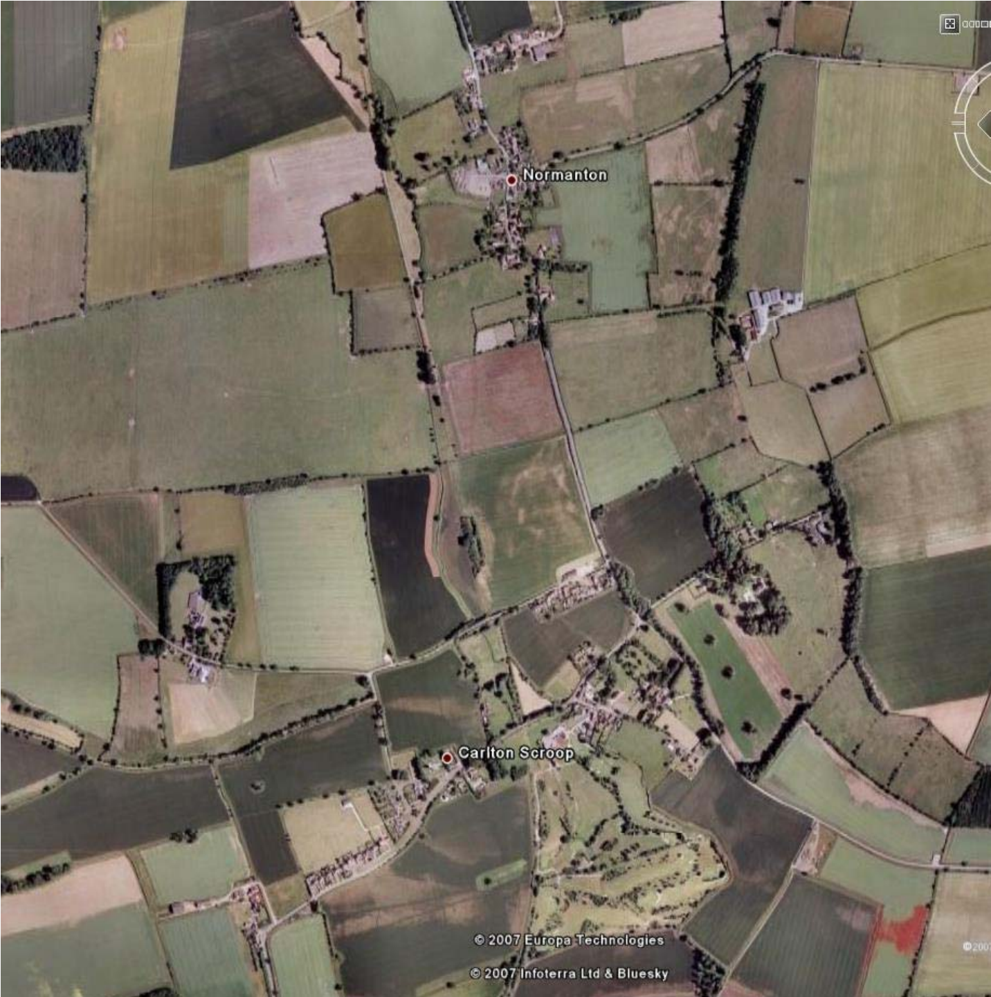
FROM 8098 FEET