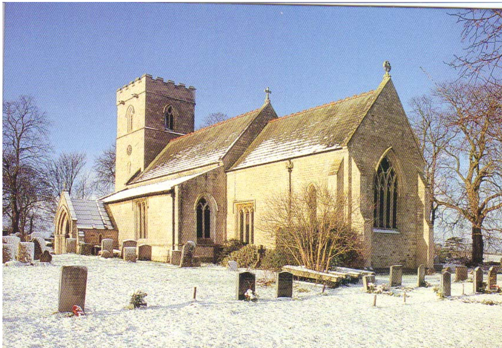
St Nicholas Church, Carlton Scroop in Winter

In 1253 a weekly market was held on a Tuesday and a yearly fair held on the eve day and morrow of Whitsunday.