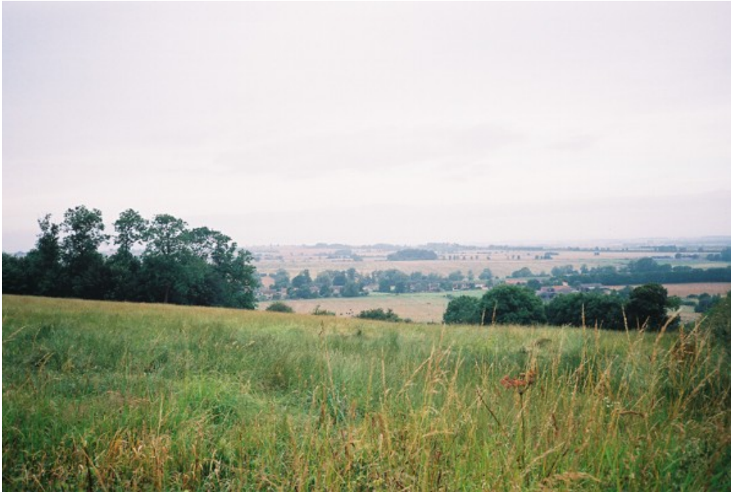
A View from Heath Lane Normanton-on-Cliffe