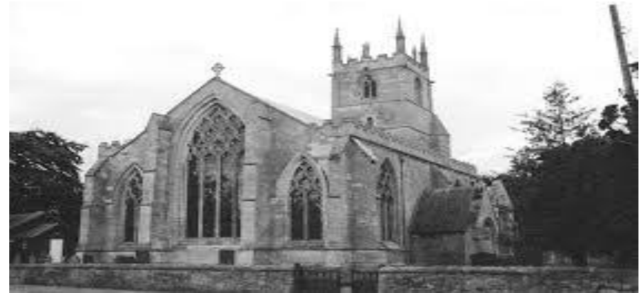
ST MICHAELS CHURCH, HIGH STREET, SWATON, NG34