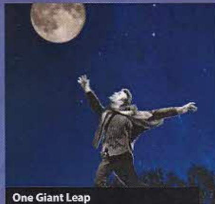
One Giant Leap

Grantham's second Gravity Fields Festival is gearing up for another scintillating programme of 120-plus events, top level presentations, serious science, international speakers and an explosive finale in Grantham.