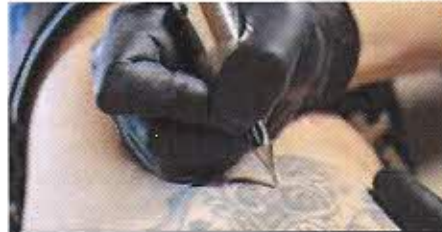
Page 8 Use registered salons for tattooing and body piercing