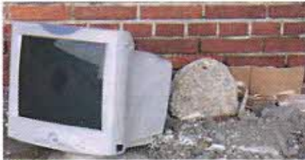
Page 2 Use home collection service to avoid flytipping