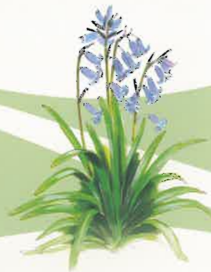
Bluebells can be found in the woods during late spring