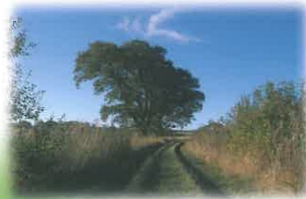
To Rigsby from Alford

In the 1640s Tothby Manor (to the north of Alford) was the site of a Plague Stone. Originally the stone was on Miles Cross Hill (the road to Spilsby). Here in times of plague, villagers would leave produce and townfolk would pay by leaving money in a trough cut in the stone, full of vinegar that would purify the money.