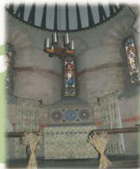
Altar at Rigsby church

Rigsby church has Norman features and a fine 15 th century carved font.