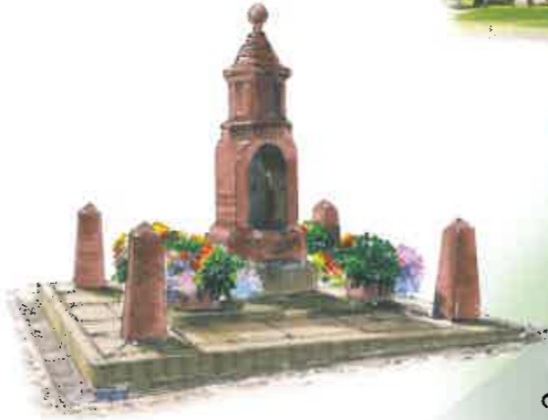
Granite fountain Market Square

Continuing along East Street, just after the Anchor Inn, is No. 3 East Street. Again 17th century, it originally faced the street, but fairly early on was reworked to face the church (or the inn).