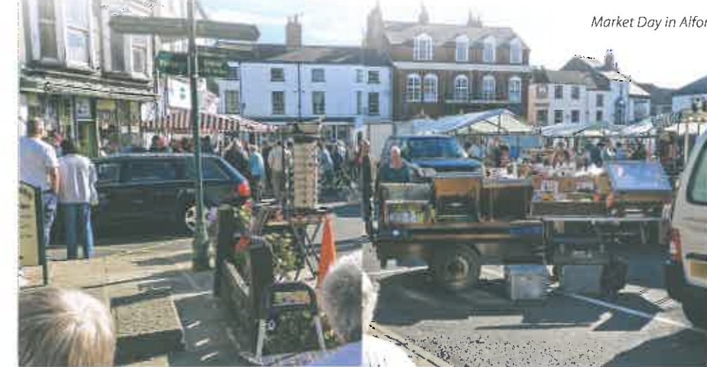
Market Day in Alford

Why not follow the visitor route around the house and gardens finishing with a cup of tea in the tearoom?